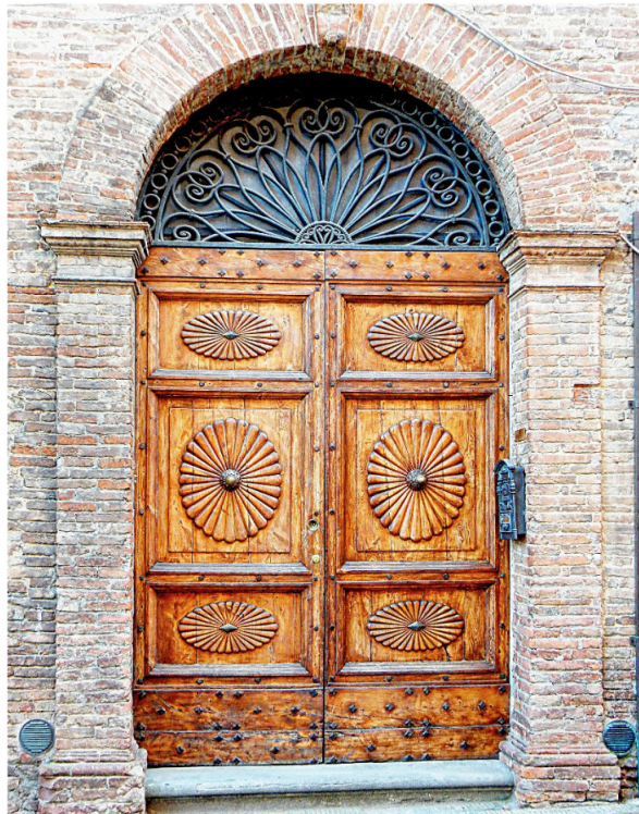
Dorothy Berry-Lound 2025